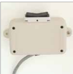
Wall mounted call/send controls