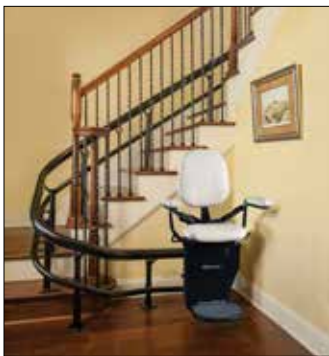
Curved Stair Lifts