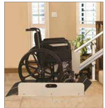
Incline Platform Lifts