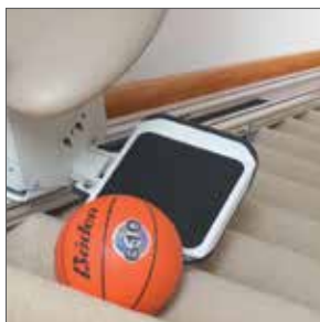
Safety sensors on footrest