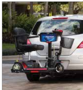
Multiple auto lift solutions for wheelchair or scooter