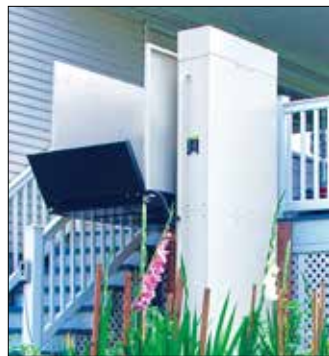
Vertical Platform Lifts