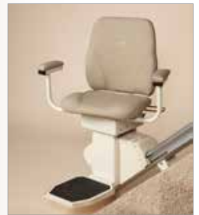
Pinnacle Heavy Duty