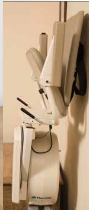
13.6" folded width for more room in your stairwell