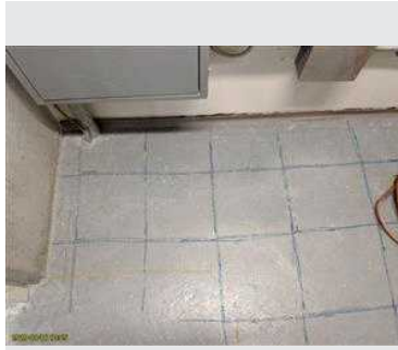
Electrical room floor Blue: bottom rebar Yellow: top rebar Slab thickness approx 6"