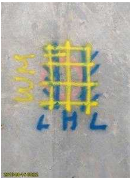
Classroom 1 kitchenette Blue hatched: low flute Yellow: wire mesh (typ.)