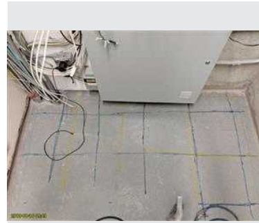
Electrical room floor Blue: bottom rebar Yellow: top rebar Slab thickness approx 6"