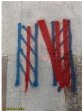
Classroom 1 change room: floor drain Blue hatched: low flute Red: conduits