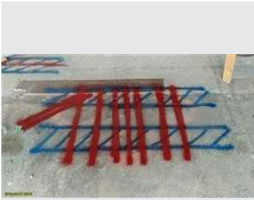
Classroom 1 change room: toilets Blue hatched: low flute Red: conduits Move: scan additional area