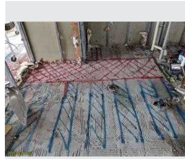
WC area extended Blue hatched: low flute Red hatched: busy with potential conduits. Do not core in this area.