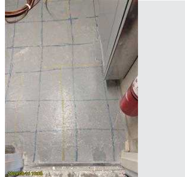
Electrical room floor Blue: bottom rebar Yellow: top rebar Slab thickness approx 6"