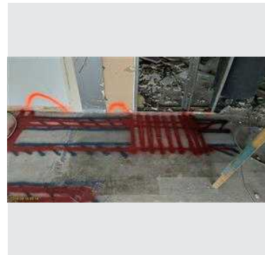
Classroom 1 change room: sinks Blue hatched: low flute Red: conduits