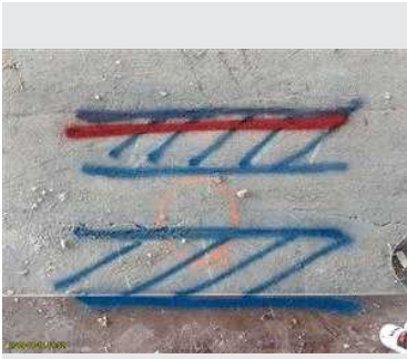
Classroom 2 sink Blue hatched: low flute Red: conduits