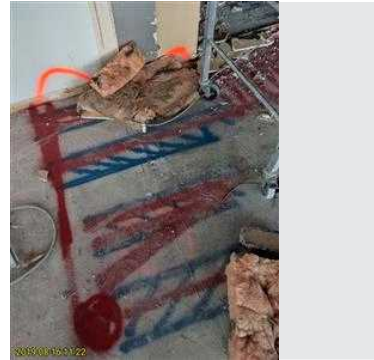
Classroom 1 change room Connect area for sink and floor drain Blue hatched: low flute Red: conduits