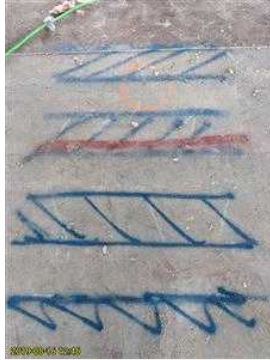
Classroom 2 sink Area extended Blue hatched: low flute Red: conduits