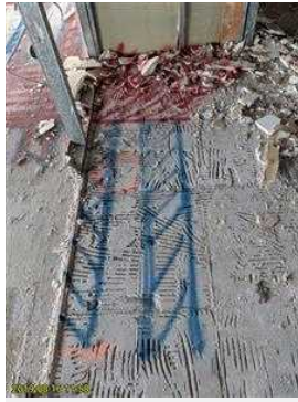
WC sink Area extended Blue hatched: low flute Red: conduits