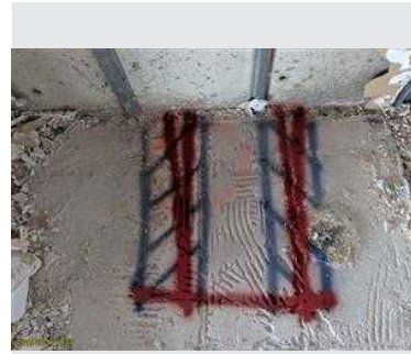
WC toilet Blue hatched: low flute Red: conduits Scan larger area