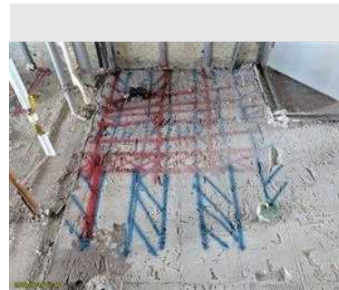
WC toilet - area extended Blue hatched: low flute Red: conduits