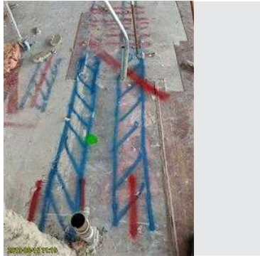
Classroom 1 change room: toilets Area extended Blue hatched: low flute Red: conduits? Could be structural reinforcing around column Green: point target