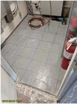
Electrical room floor overview Blue: bottom rebar Yellow: top rebar Slab thickness approx 6"