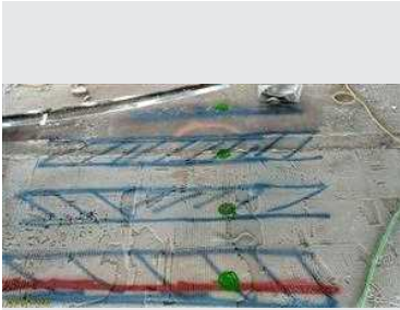
WC sink Area extended Blue hatched: low flute Red: conduit Green: point target. Check for beam below