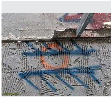
WC sink Blue hatched: low flute Scan larger area