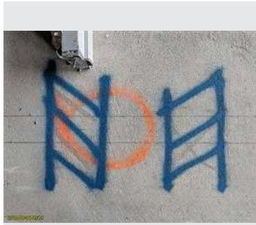
Staff room sink Blue hatched: low flute