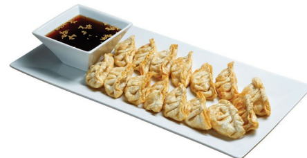
Pot Stickers (18) $8.99