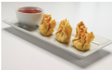
Crab Rangoon (15) $5.99