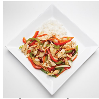
Szechuan Spicy Bell peppers, onions, and bamboo, stir-fried with a homemade Szechuan sauce