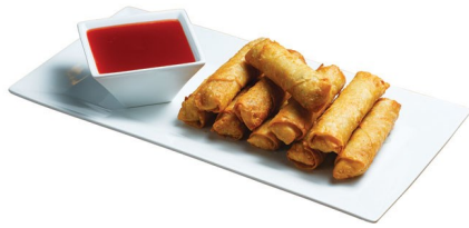
Egg Roll (10) $10.99