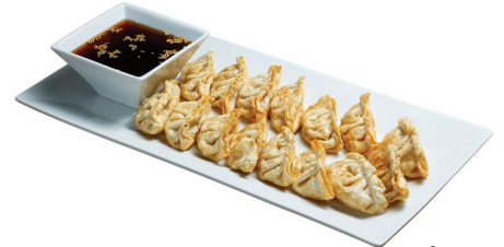
Pot Stickers (18) $10.99