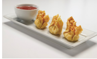
Crab Rangoon (15) $7.69