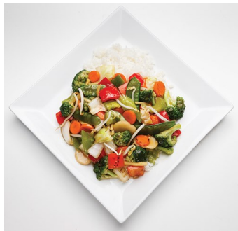
Vegetable Deluxe Assorted vegetables and homemade soy gravy

Chicken or Tofu –Serve 4 $21.79 Serve 8 $42.99 Beef or Shrimp – Serve 4 $26.99 Serve 8 $52.99