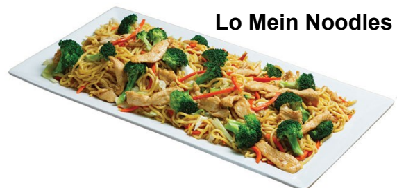
Lo Mein Noodles