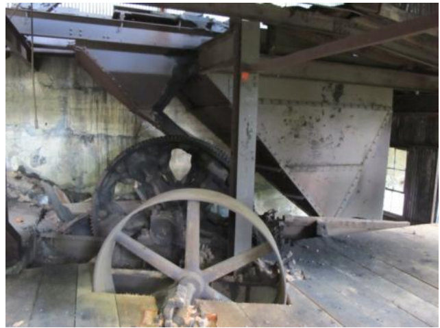
Views of the mine portal and the head house. A new observation deck has been added to the side of the head house to allow visitors to look inside the building and also to look down the conveyor to the tibble and the river below.