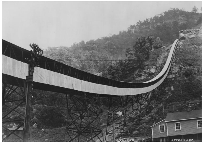
Historic Views of the Tipple and Conveyor.