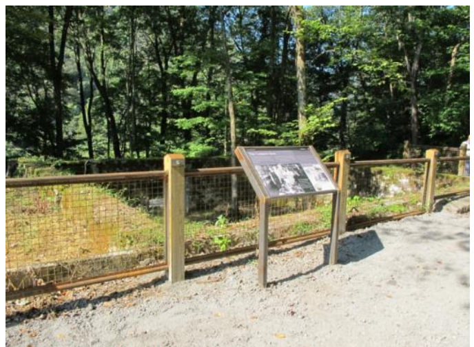
Views around the coke ovens. Upper left photo looks north towards the coke ovens with the sand house foundation in the foreground. The upper right is a view of the wayside and bench along the southern end of the wharf trail that passes in front of the bank of ovens. The middle left photo shows an intact coke oven adjacent to the company store and the middle right shows the main town road above the coke ovens. The lower photos show the road above the ovens and a detail of the wayside for the company store foundation ruins.