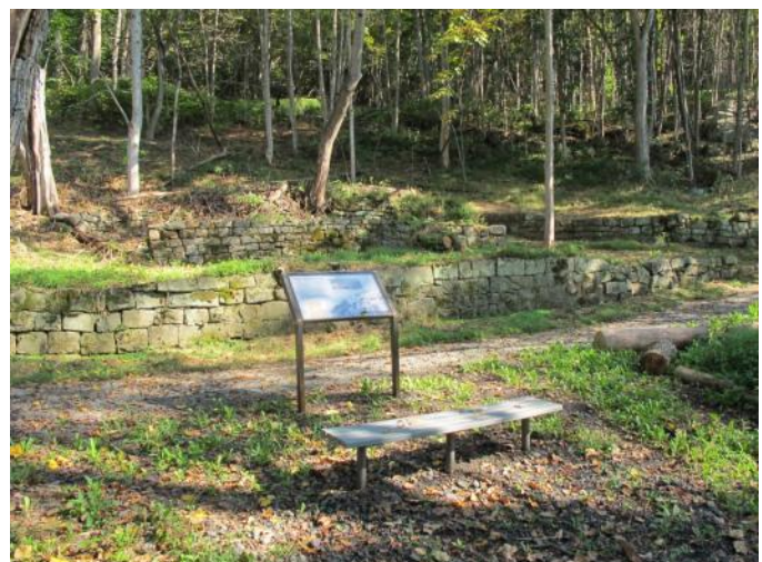
Views of various ruins with wayside interpretation. Upper photos show the Clubhouse parking area with a vault toilet, vertical wayside and bulletin board cabinet. The middle left photo shows the boarding house wayside at the end of the parking area and the middle right photo shows the White Church foundation and wayside. The lower photos shows the White School foundations on the left and a typical residential foundation on the right.