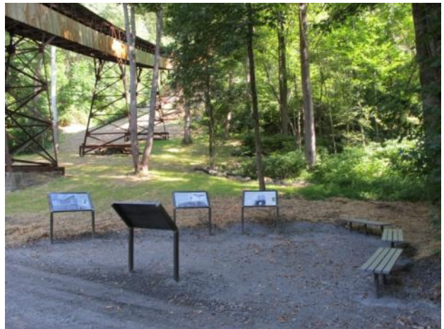
Views of the Conveyor and the interpretive area by the main road behind the tippie.