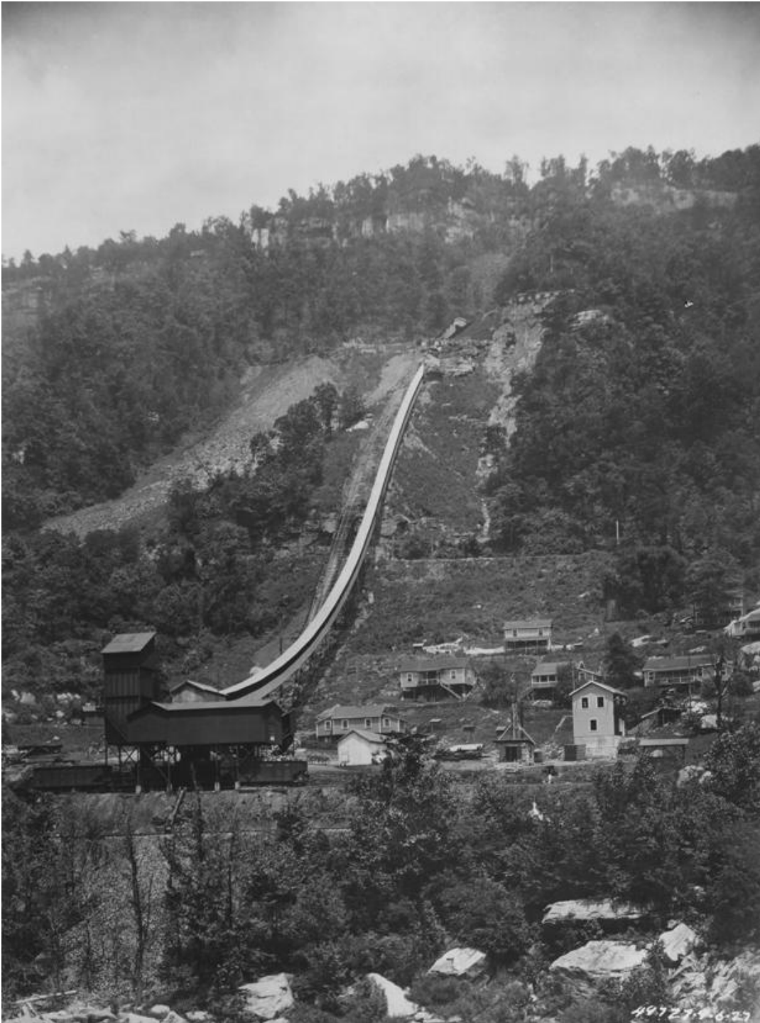
View of Nuttallburg in 1927 from the Ford Archives in Dearborn, Michigan.