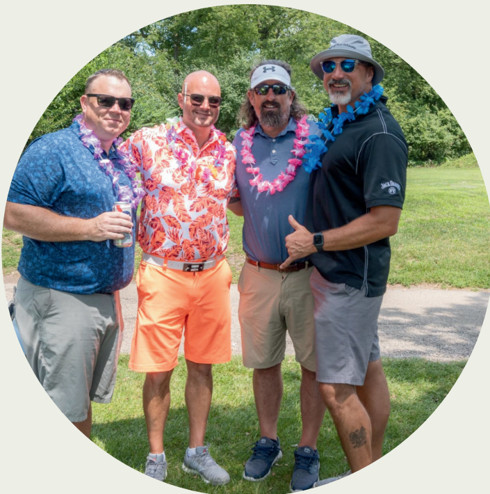
GAMES & FUN