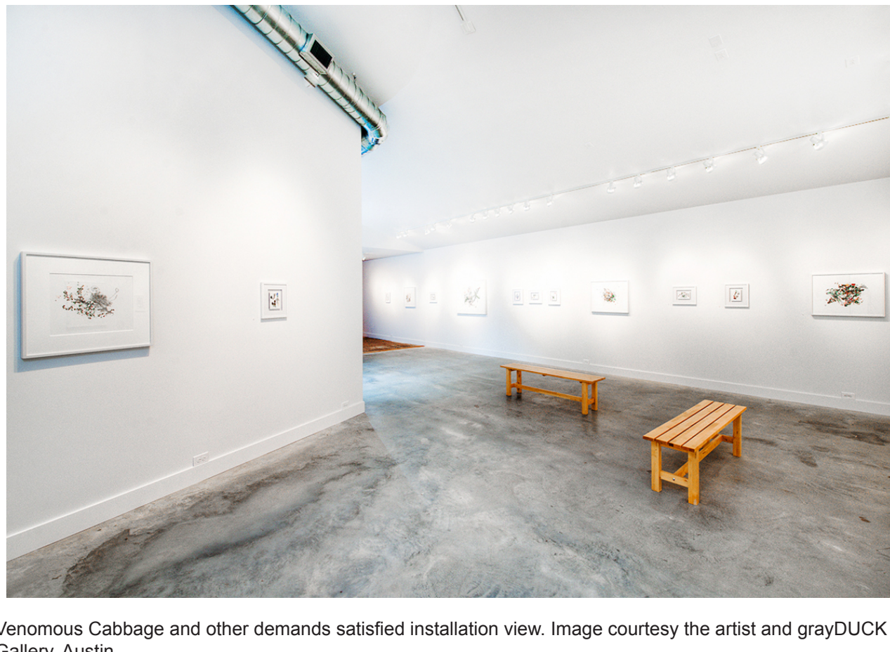
Venomous Cabbage and other demands satisfied installation view. Image courtesy the artist and grayDUCK Gallery, Austin.