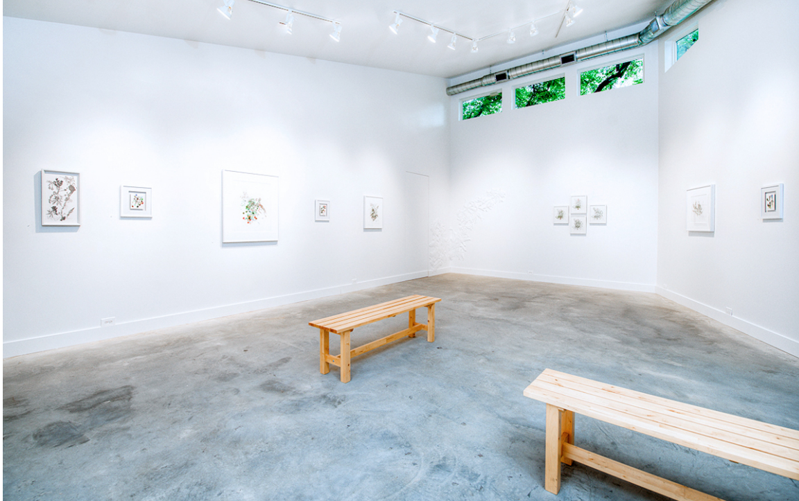
Venomous Cabbage and other demands satisfied installation view.