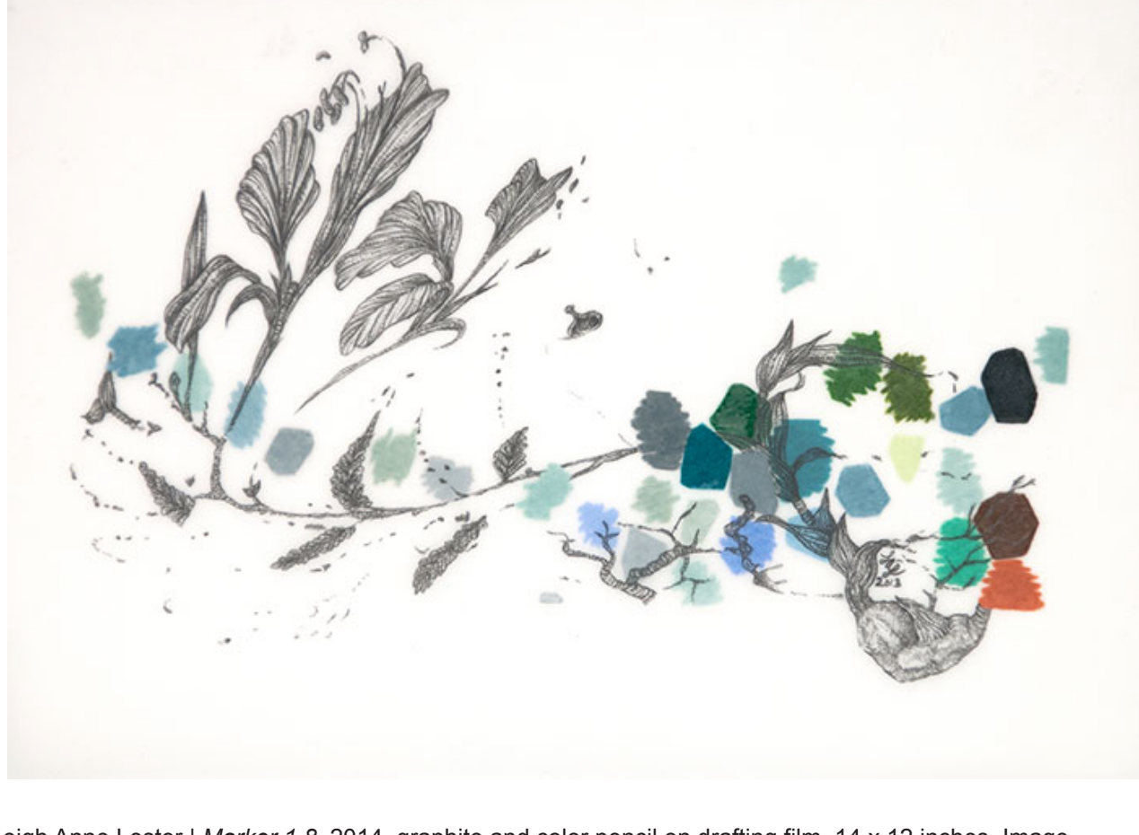
Leigh Anne Lester | Marker 1.8 , 2014, graphite and color pencil on drafting film, 14 x 12 inches.

Lester's 'color cells' — dots, chips, or great lozenges of pure color that stipple or consume her botanical compositions — are a recent development in her ongoing investigation into representing genetic modification and its aftereffects. They're a neat compositional trick here, like how the cool tones of Marker 1.8 snake around a leafy anonymous bulb, visually destabilizing it while echoing the hybrid plant's shape. In Deviant Pollination , tonal blots explode outward from a tight mass of spiny graphite flora, deliquescing into tinier and tinier bits like a pollen-accented sneeze in freeze-frame. It is notable that this work, like the majority in the show, feature botanical drawings in pure grayish graphite, though when viewed with color cells clouding the perimeter, our eyes connect the vibrant, cellular hues to the drained plants themselves.