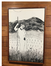
15 Weylin Neyra, Of Itself , 2020, acrylic & ink on canvas, framed with African mahogany wood, 25 x 36 inches. $1,600