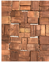
13 Jay Jones, Untitled mosaic (3.1 Mbit tesserae) , 2014/2020, cast ceramic, oxide stains, dimensions variable. $1,000 (whole) $40 per tile