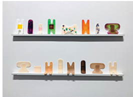
12 Ling-lin Ku, Healing , 2020, silicon rubber, plastic, wood, 30 x 0.7 x 16 inches. $1,100