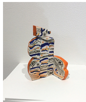
08 Diego Mireles Duran, Figura (Coschecha de Casquito de donde vivia el espiritu de la etimología de la palabra Iztaccihuatl), Figure (Harvested husk of where the spirit of the etymology of the word Iztaccihuatl once lived) , 2020, polymer clay, acrylic, 7 x 4 x 4 inches. $675 - 50% of proceeds will be donated to RAICES