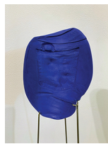
06 Rachael Starbuck, Left between , 2020, P-6 paper pulp, joint compound, glue, flour, ultramarine pigment, steel, 9 x 4 x 43 inches. NFS