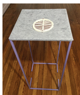
02 Ariel Wood, release/return , 2020, steel, acrylic, ceramic, silicone, felt, and thread, 47.5 x 20 x 20 inches. $300