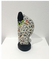
10 Diego Mireles Duran, Toe meditation , 2020, polymer clay, acrylic, 8.5 x 3.5 x 3.5 inches. $750 - 50% of proceeds will be donated to RAICES