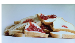
03 Alex Kang, Nocturne , 2017, mp4 video with sound, 28:14. NFS