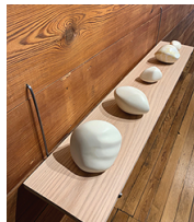
14 Rachael Starbuck, Handhold (1-5) , 2020, Hydrocal, durham's water putty, dimensions variable. NFS