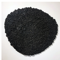
05 Christina Coleman, Black Hole , 2020, synthetic braiding hair, 34 x 37 inches. $500