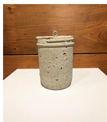
16 André Fuqua, Mason jar , 2018, concrete, 3 x 4.5 inches. $700