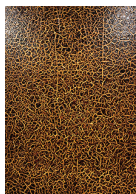
01 Christina Coleman, Two Lines , 2014, hair gel on paper, wood panel, 60 x 42.5 inches. $1000