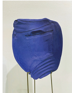
07 Rachael Starbuck, Right between , 2020, P-6 paper pulp, joint compound, glue, flour, ultramarine pigment, steel, 8 x 4 x 43 inches. NFS