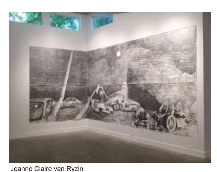
"Monsters" from a solo exhibit by Rachel Wolfson Smith at Grayduck Gallery.

Smith's moralizing isn't the least bit subtle in the mural-size "Monsters." Rendered on six large sheets of paper tacked together, the 21-foot-long drawing wraps a corner in the gallery and depicts an ominous night scene of a horrific crash of luxury cars, a street sign for "Wrath Avenue" collapsed in the rubble.