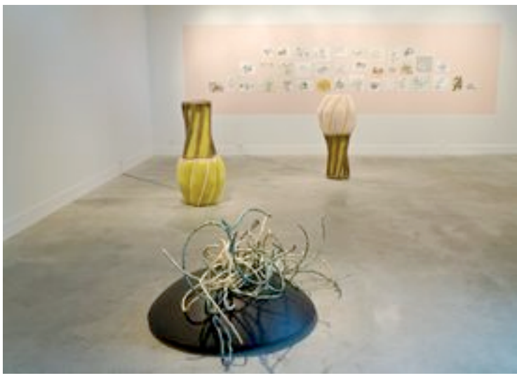
Installation shot of Gracelee Lawrence's solo exhibit "Mouthfeel" at Grayduck Gallery.

But it seemed like a clever way to spin the event, and so Castillo went with it. What he wanted to do is take the process of selecting an exhibit — something that's usually conducted behind closed doors — and put it in front of an audience.