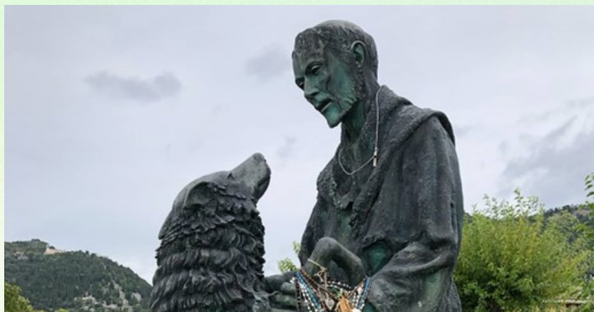
A statue of St Francis and the Wolf in Gubbio, Italy

Make me a channel of your peace — Where there is hatred, let me bring love; Where there is injury, your pardon, where there is doubt, faith; where there is despair, hope; where there is darkness, light.