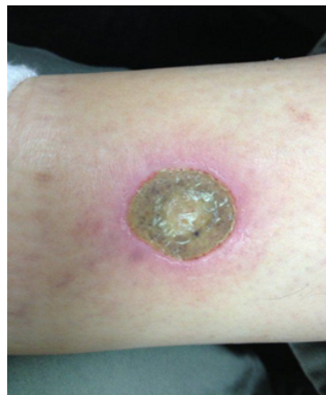
Figure 1. Ulcerated Leg Wound (before PracaSil-Plus formula)

Case Description: A 61-year-old Caucasian male with type 2 diabetes, a sedentary lifestyle and an occupation that involves a seated position, presented with a 4 mm (approx.) diameter ulcer on his inner leg, from 8 to 10 mm above the right ankle (Figure 1). Treatment was initiated using a compounded medicine containing mupirocin 2% in PracaSil-Plus (Figure 2), which was applied topically to the ulcer three times daily. A second compounded medicine containing pentoxifylline 3% and nifedipine 3% in Lipoderm™ (Figure 3) was applied topically to the marginal area of the ulcer, also three times daily, in order to increase blood circulation. The patient was instructed to exercise every hour using an elastic band, also to improve blood flow to the ulcerated area. The wound was closed following 63 days of treatment (Figure 4).