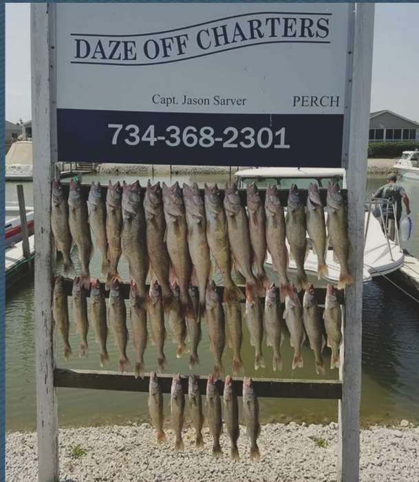
Walleye, Yellow Perch