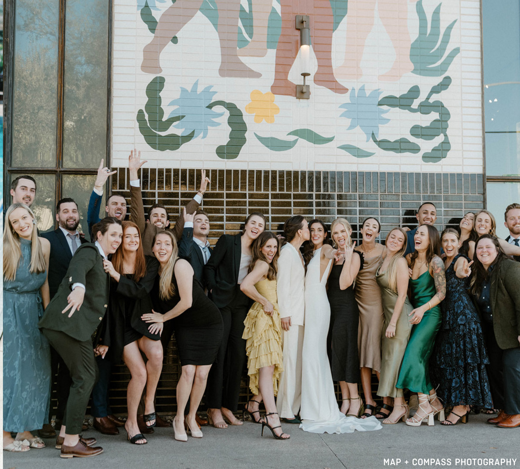
MAP + COMPASS PHOTOGRAPHY