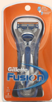
12.39 Gillette Fusion, 1 ct