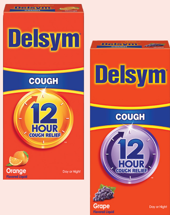
Delsym Adult Cough Liquid, Grape & Orange, 3 oz