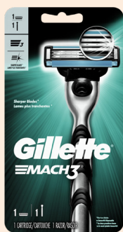
8.19 Gillette Mach 3, 1 ct