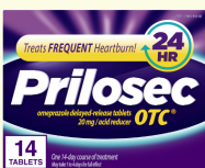
11.59 Prilosec OTC, 14 ct