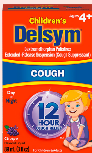
Delsym Children's Cough Liquid, Grape & Orange, 3 oz