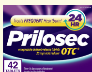
25.99 Prilosec OTC, 42 ct