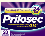
19.39 Prilosec OTC, 28 ct