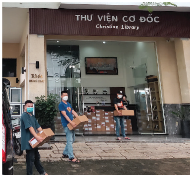
Boxes of books from the Network being unloaded at the Library in Ho Chi Minh