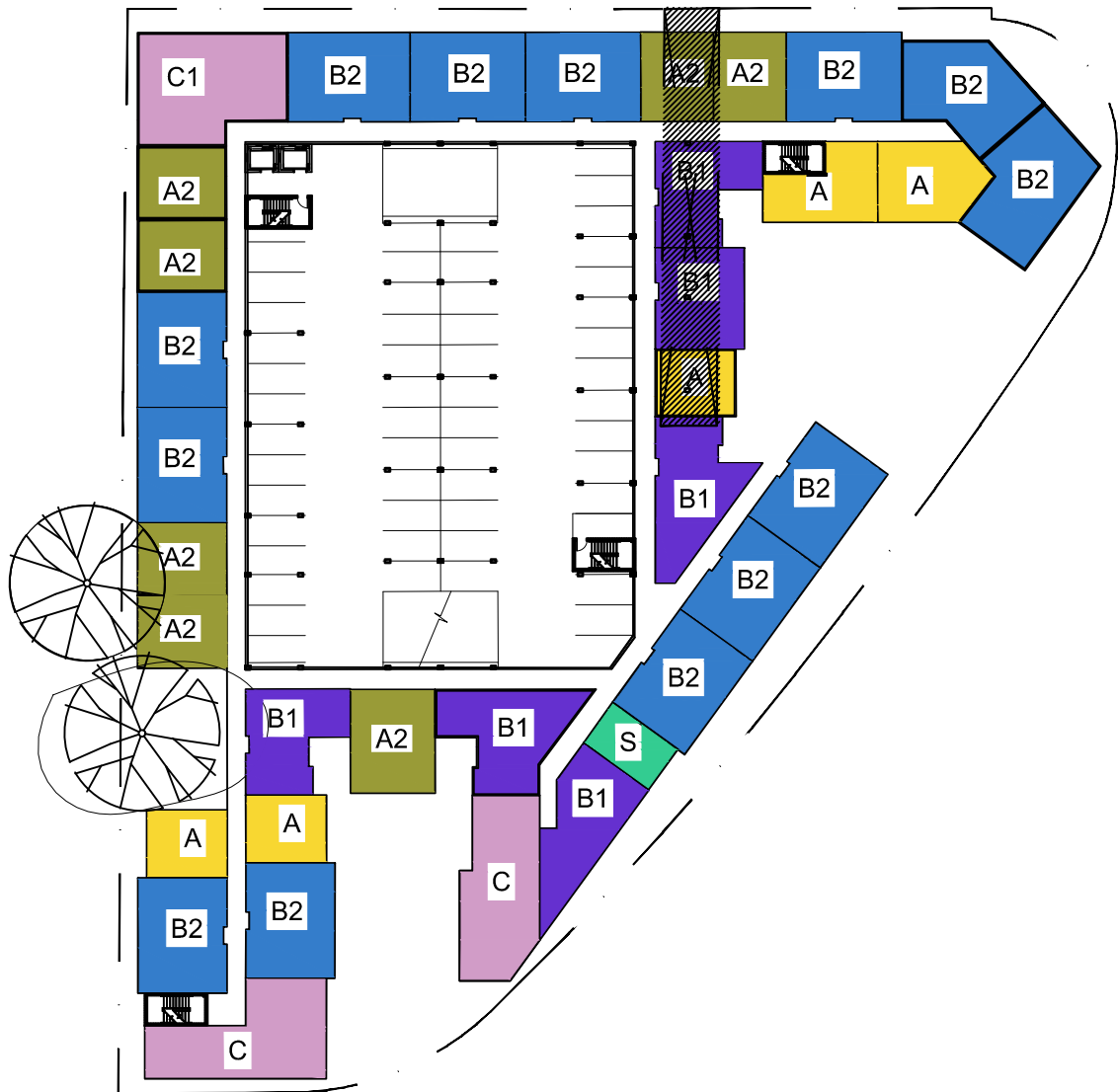
① THIRD TO SIXTH FLOOR