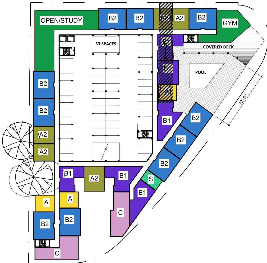
① SECOND FLOOR