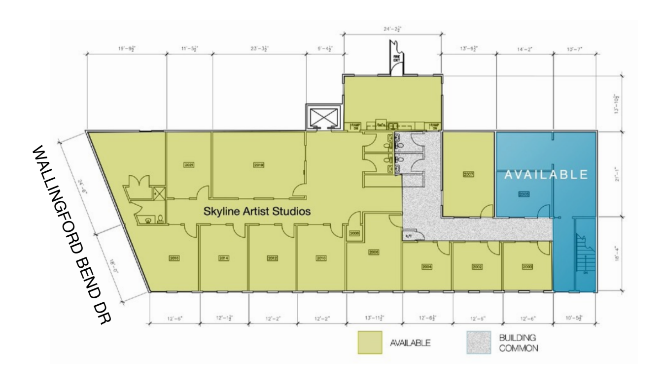
N LAMAR BLVD