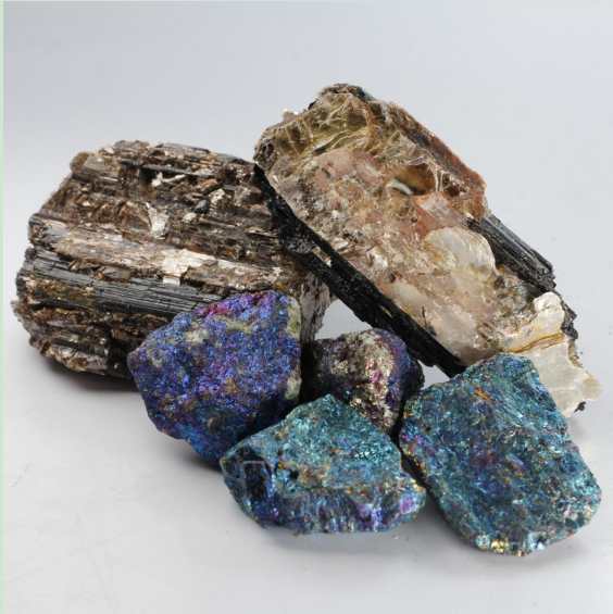
Black Tourmaline & Chalcopyrite RESTOCKED (again!)

Fluorescent Minerals - UV Light Calcite, Paraiba Kyanite & More!