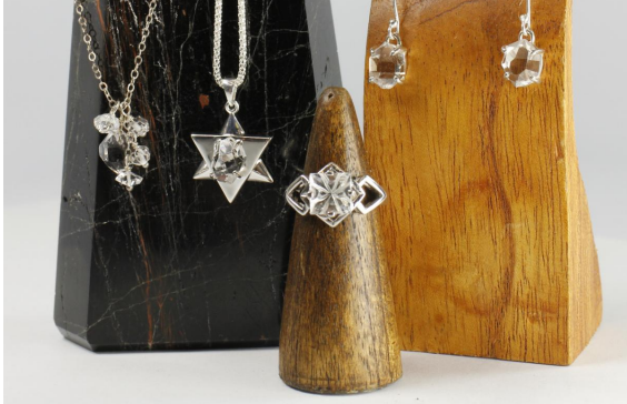
Herkimer Jewelry Restocked!