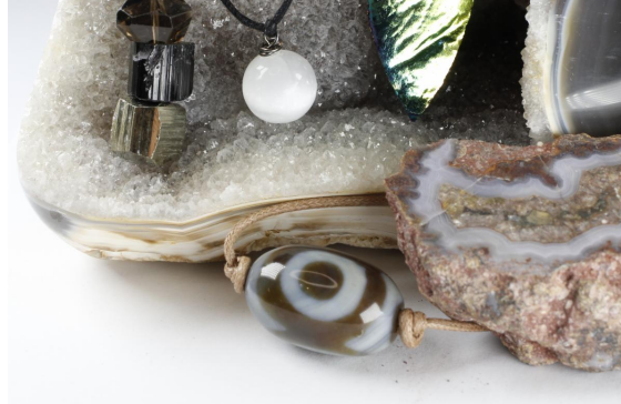
Sweet Satya Line New Stones & Designs!