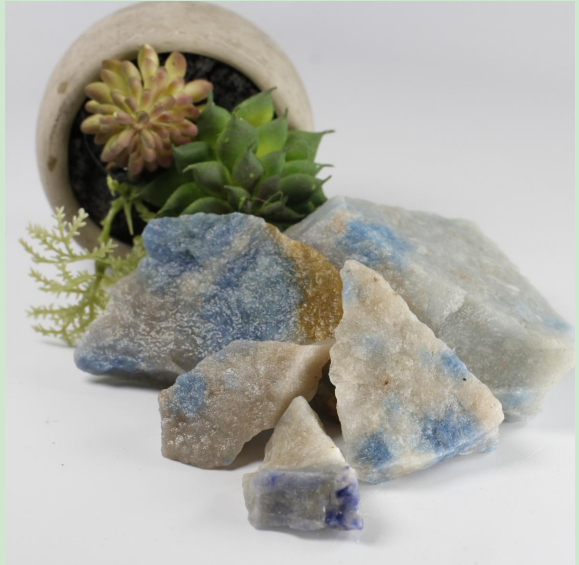
Paraiba Quartz (aka Trolleite) Limited Supply

Handheld UV Lamps Longwave and Shortwave Options