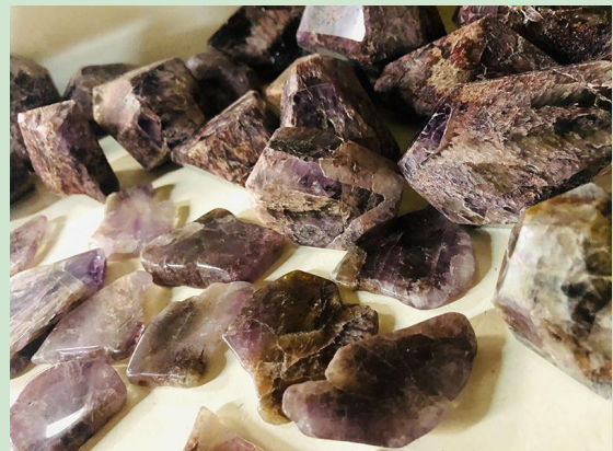
Cacoxenite in Amethyst Restocked