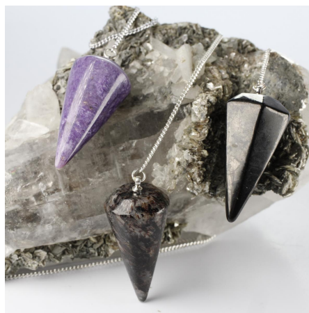
Natural Stone Pendulums Including Charoite, Shungite, Astrophyllite