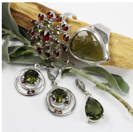
Moldavite Jewelry While Supplies Last!