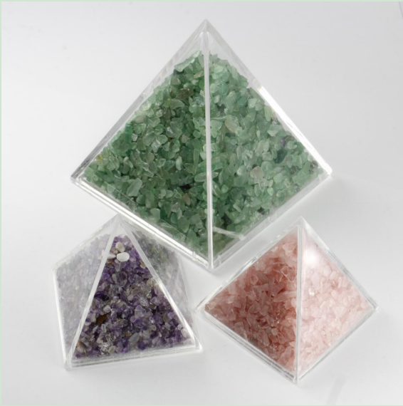
Feng Shui Pyramids