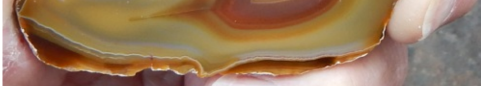
Cut & Polished Island Agate Pair $55