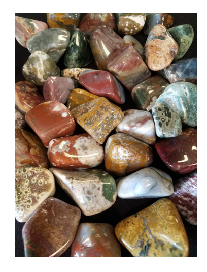
Ocean Jasper (Tumbled In-Store!) $4.00 ea