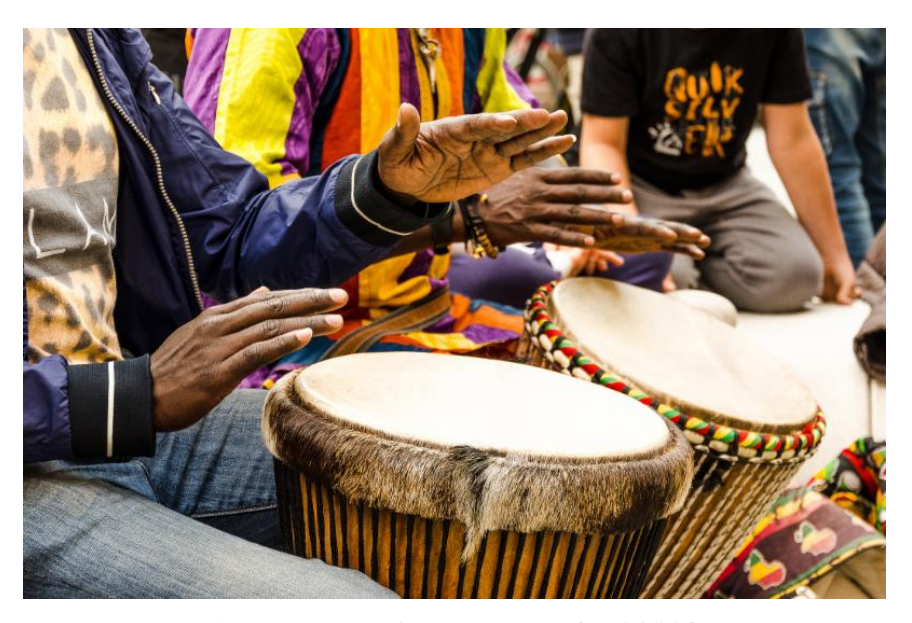
Are you planning an event for 2018? Nature's Treasures has a 2,200 sq ft Auditorium and 1,200 sq ft Studio Space available for your event.

Check our <u>calendar</u> for availability and email our Events Director at - community@ntrocks.com.