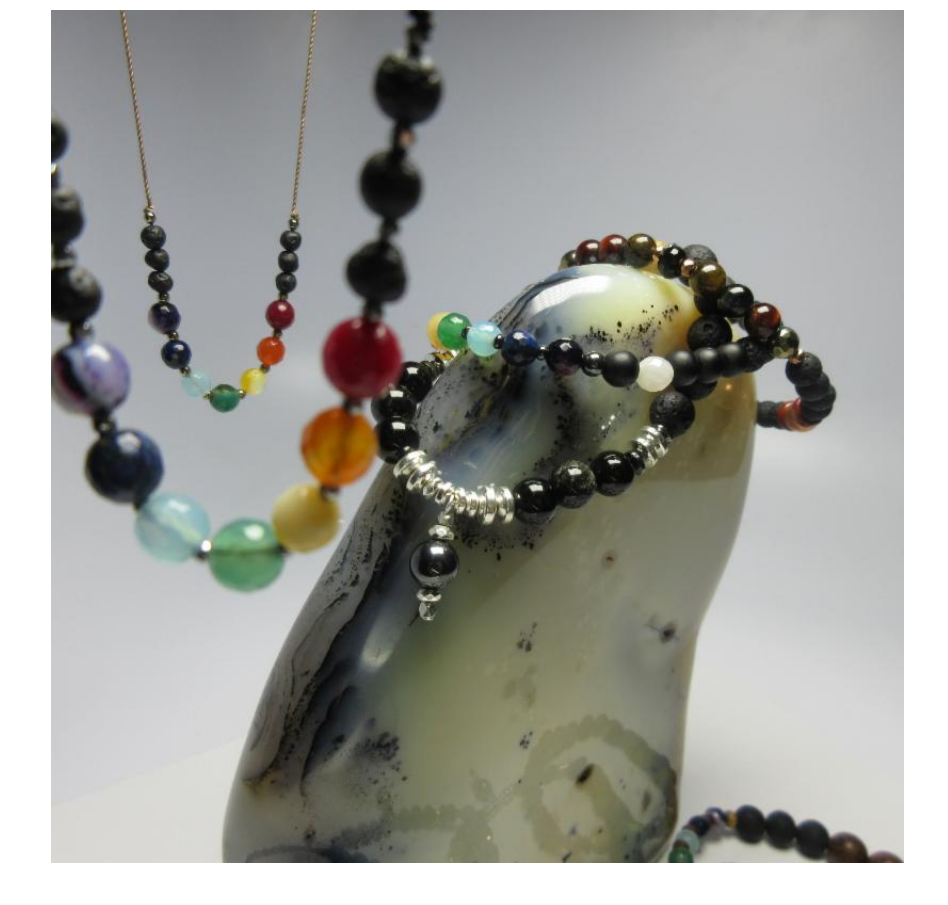
Free Standard Shipping for Orders over $50.00