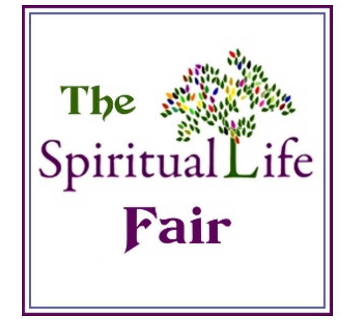
Saturday, December 8th NT Auditorium