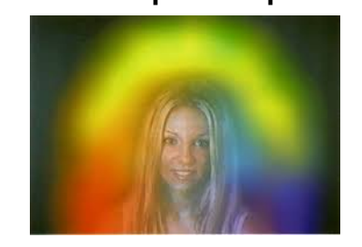
With our updated Aura Machine, you can see the color of your aura.

Offered daily and starting at only $25, this is a great gift to give yourself or a loved one.