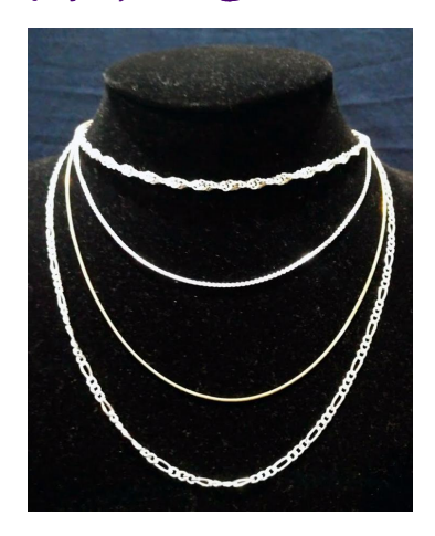
Sterling Silver & Gold Plated Chains