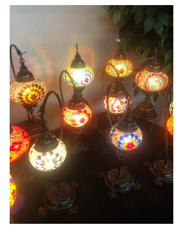
Mosaic Lamps Are Back