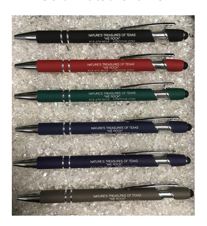
Nature's Treasures Pens! $5.00 ea