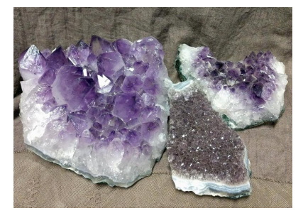
Amethyst Clusters $18/lb