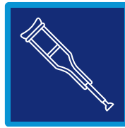
Crutches, Canes, & Accessories