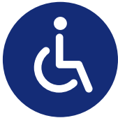
Wheelchairs & Accessories