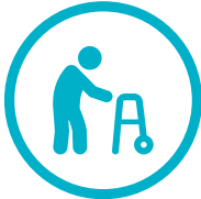
Walkers & Accessories