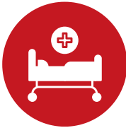
Hospital Beds & Accessories