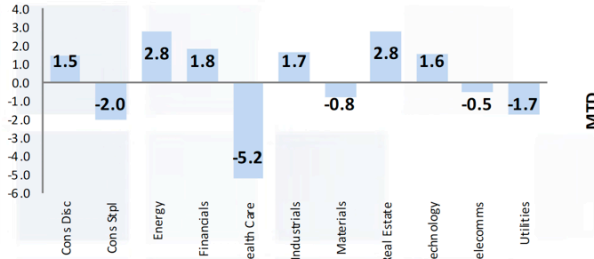
S&P 500 Sector Returns