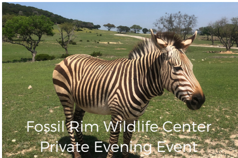
Fossil Rim Wildlife Center Private Evening Event