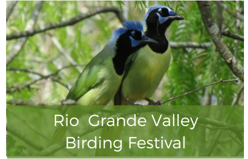
Rio Grande Valley Birding Festival