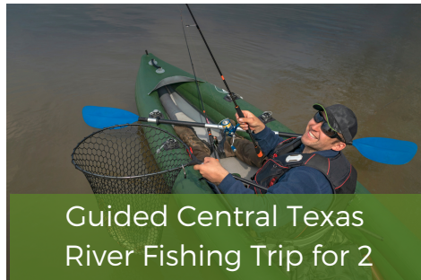
Guided Central Texas River Fishing Trip for 2