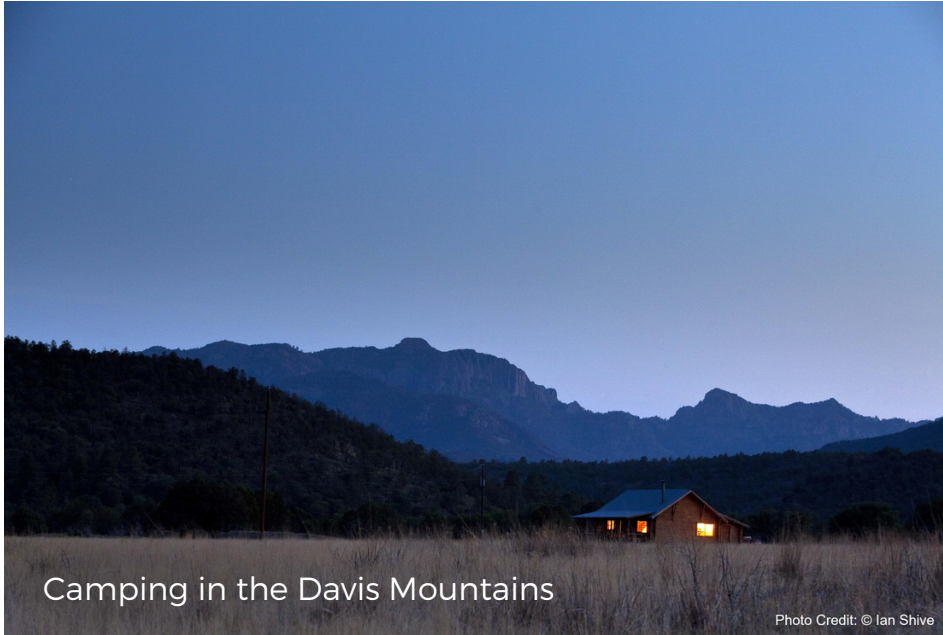
Camping in the Davis Mountains