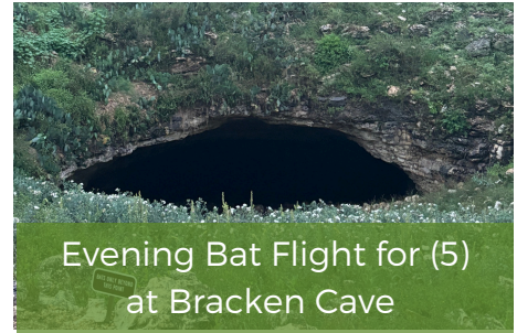
Evening Bat Flight for (5) at Bracken Cave