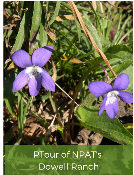
PTour of NPAT's Dowell Ranch