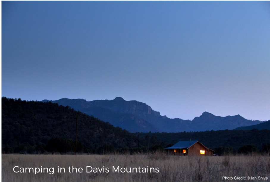
Camping in the Davis Mountains