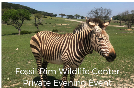
Fossil Rim Wildlife Center Private Evening Event