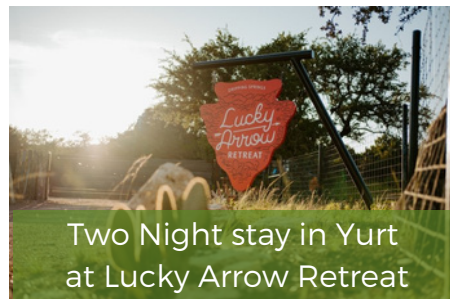
Two Night stay in Yurt at Lucky Arrow Retreat