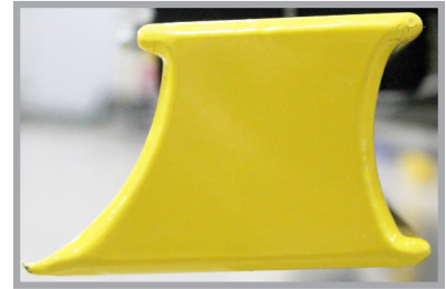
Extruded Finish Blade Profile