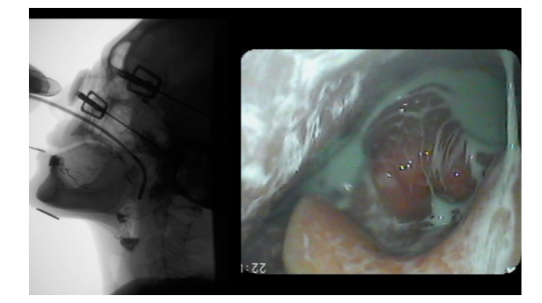
Fig. 2 Simultaneous view of bolus spillage prior to swallow

inpatients and outpatients given FEES exams over a 2.5year period [15]. The most common diagnoses of the study patients were stroke and other neurologic diseases. Results showed no instances of airway compromise or laryngospasm, 6 cases of epistaxis (1.2%), all self-limiting, and no significant change in vital signs before and after the procedure. These authors reported on another series of 1340 patients in 2005 [16]). Incidence of complications were fewer than in their initial study (epistaxix = 0.07%) and no instances of airway compromise. Willging reported safety data for over 500 pediatric FEES exams [4]. There were four cases of epistaxis and no cases of laryngospasm. More recently, in 2016, a report of complications in 2820 FEES exams was published [17] Subjects included inpatients and outpatients. They reported 4 cases of epistaxis (0.14%), three cases of vasovagal syncope (0.1%), and 2 cases of laryngospasm (0.07%), three of which occurred in patients with ALS. All resolved spontaneously. In summary, FEES has been shown to be extremely safe with all reported complications being minor and spontaneously resolved.