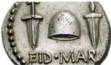
Reverse side of a coin issued by Caesar's assassin Brutus in the autumn of 42 B.C., with the abbreviation EID MAR (Eidibus Martiis) – on the Ides of March).

The Ides of March has a non-threatening origin. It was a marker for lunar phases, and once signified the first day of the Roman New Year. (Until Julius Caesar