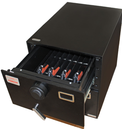
Class 6, legal size, single lock in black shown above