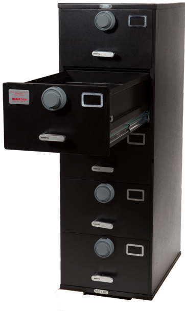
Class 5, 4- drawer, legal size, multi-lock in black shown to left

The Class 5 cabinets are approved for the storage of secret, top secret, and confidential, as well as Class 1 & 2 controlled substances, monetary funds, and precious metals. While the Class 6 cabinets are approved for the storage of secret, top secret, and confidential