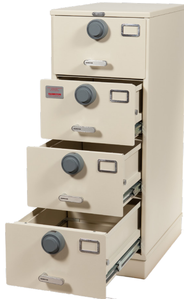
Class 6, 4 drawer, legal size, multi-lock in parchment shown below