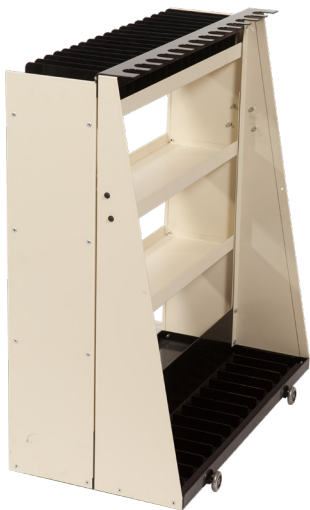
"T" High Barrel Support