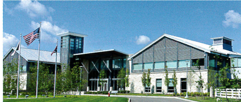
BOB EVANS HEADQUARTERS NEW ALBANY, OHIO

We provide our customers with the highest quality of construction services at a fair price with the aim of building long term customer and supplier relationships.