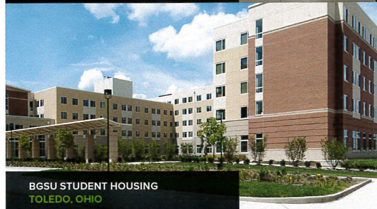
BGSU STUDENT HOUSING TOLEDO, OHIO