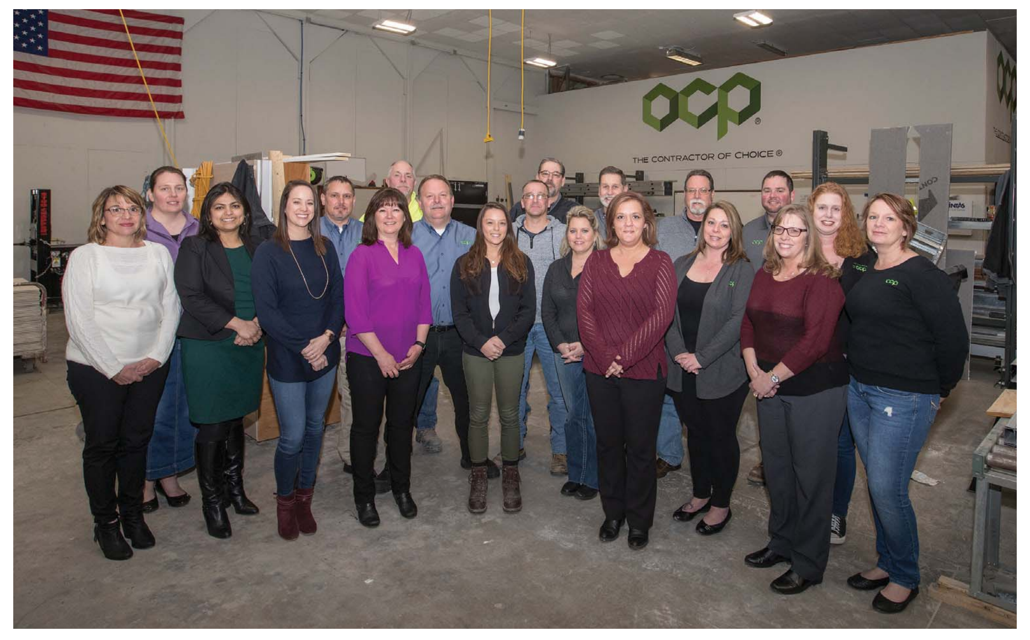
LEADING THE WAY OCP Contractors' Toledo team consists of the industry's leading professionals, with decades of experience. The team is consistently innovating construction processes to positively impact the communities it builds within.