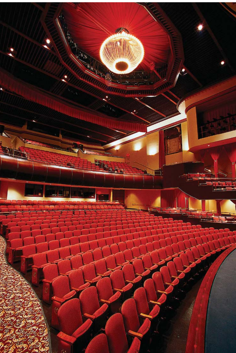
AN IMPRESSIVE PORTFOLIO OCP is the interior contractor on the new ProMedica Generations of Care Tower (top left, bottom left). The 275-foot-tall tower, when completed, will feature 1.3 million square feet of drywall, or over 2.8 million pounds! OCP's portfolio also includes the Valentine Theatre (right) in Toledo, OH.

structural and light gauge metal studs, fireproofing, spray foam insulation, panelization, ACM panels, drywall, insulation, acoustical ceilings, painting, toilet partitions, doors, frames and hardware. This past year in Toledo alone, they contracted more than $20 million worth of work.