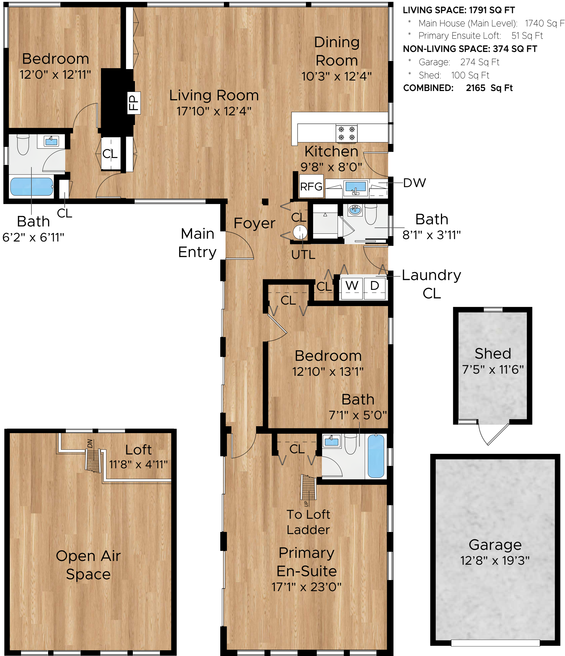
Loft - Primary En-Suite