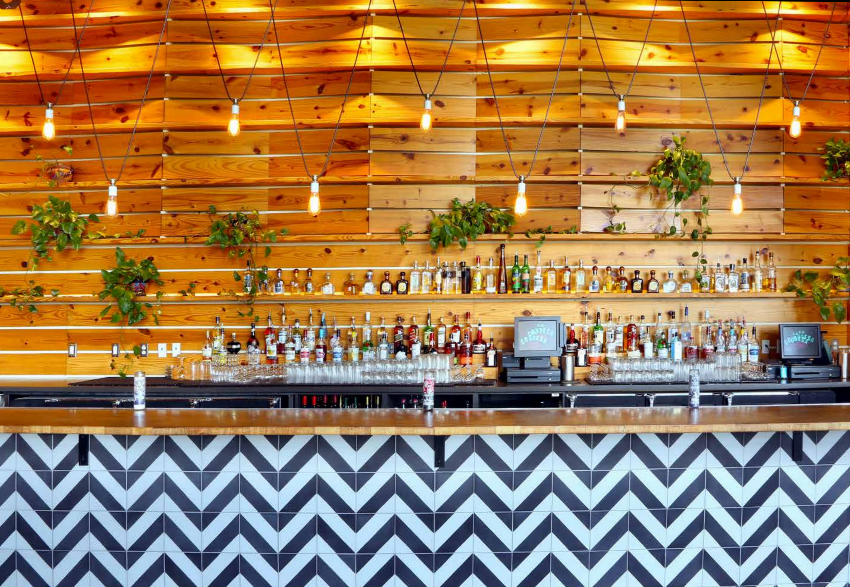
The Bar at Malverde