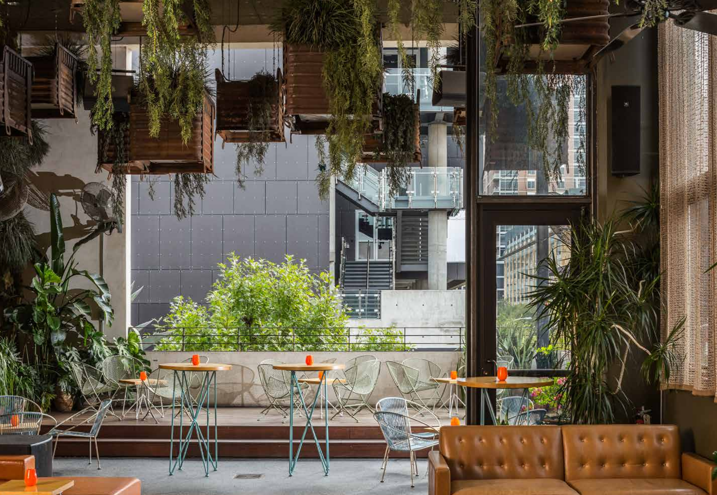
The Patio at Malverde