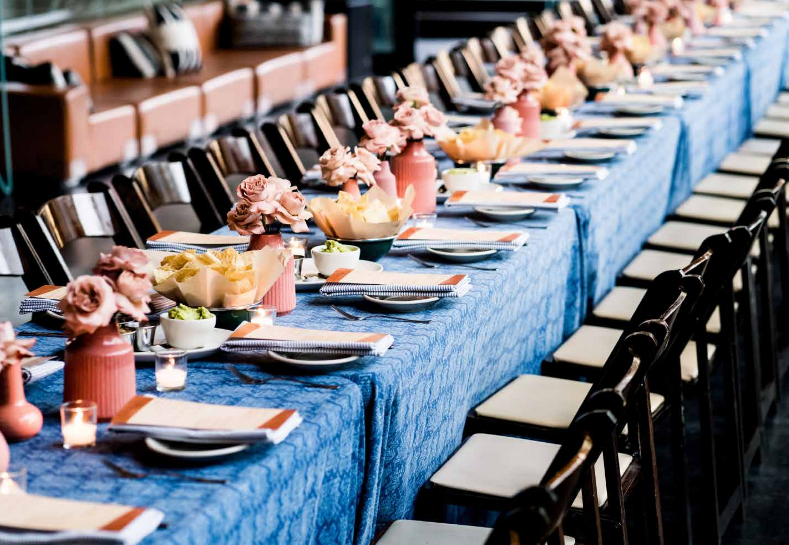
Family Style Seated Event