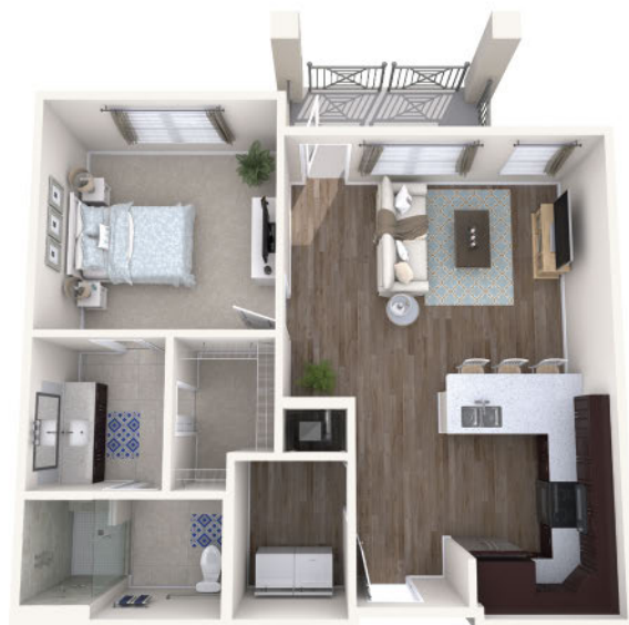
Cayman (823 sq ft) – 1 Bedroom, 1 Bath