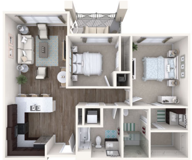
Cedar Grove (1,045 sq ft) – 2 Bedroom, 2 Bath