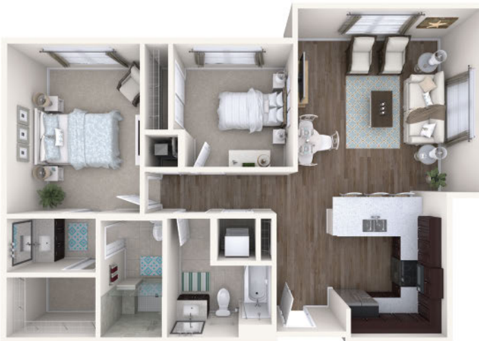
Palmetto (1,081 sq ft) – 2 Bedroom, 2 Bath