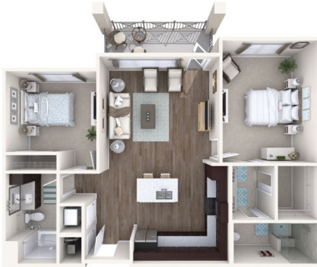
Driftwood (1,146 sq ft) – 2 Bedroom, 2 Bath