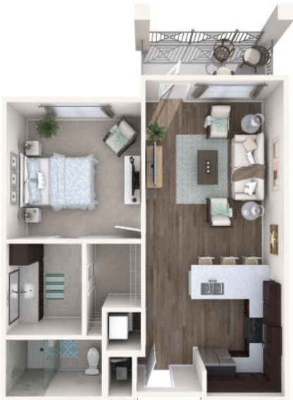
Beachside (725-751 sq ft) – 1 Bedroom, 1 Bath