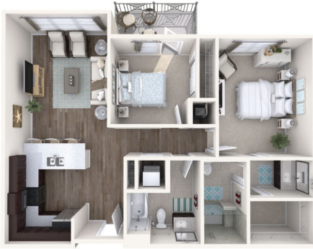
Biscayne (1,025 sq ft) – 2 Bedroom, 2 Bath