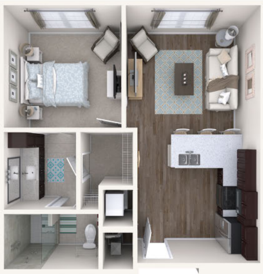
Shoreline (646 sq ft) – 1 Bedroom, 1 Bath