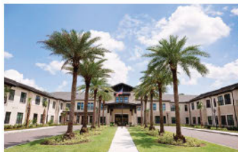
STARLING AT NOCATEE ASSISTED LIVING