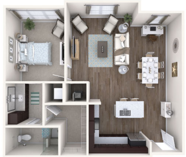
Boardwalk (989 sq ft) – 1 Bedroom, 1 Bath