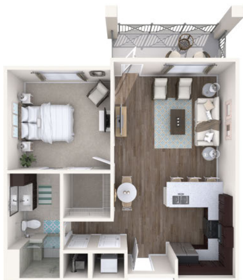
Cypress (795 sq ft) – 1 Bedroom, 1 Bath