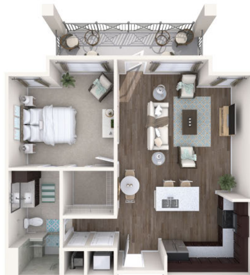
Hibiscus (844 sq ft) – 1 Bedroom, 1 Bath