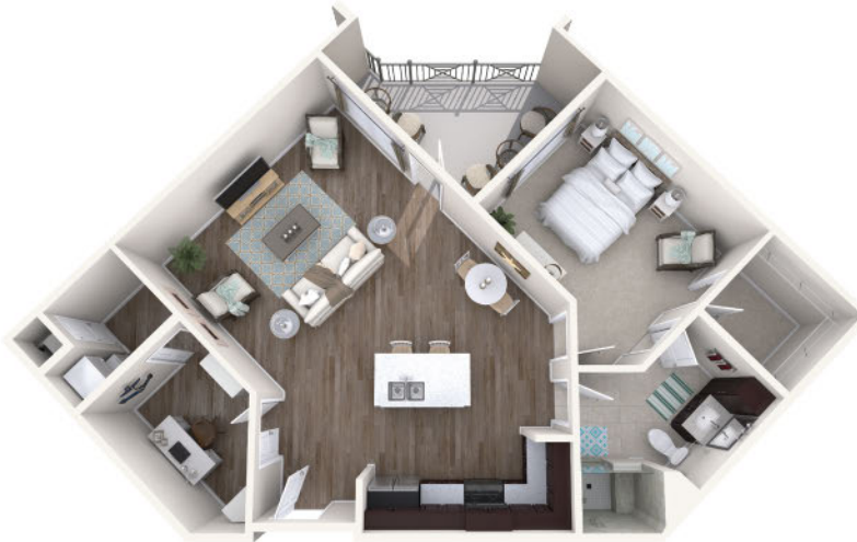
Sea Dune (985 sq ft) – 1 Bedroom + Den, 1 Bath