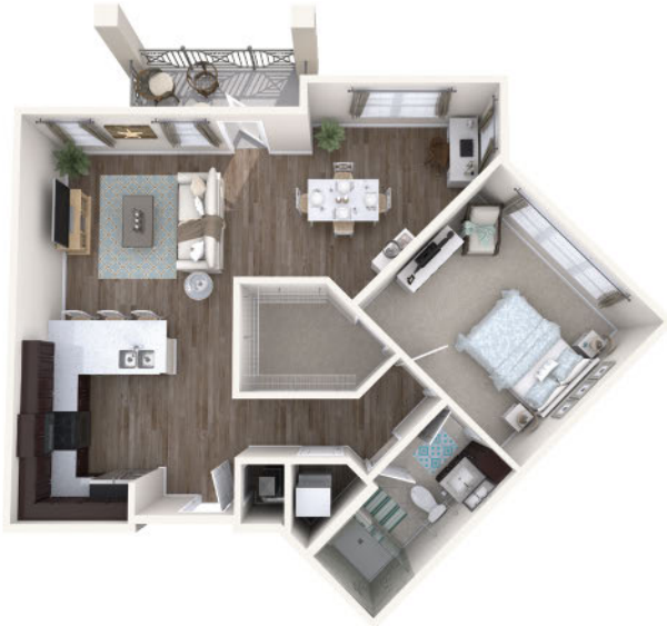
North Shore (937 sq ft) – 1 Bedroom + Den, 1 Bath