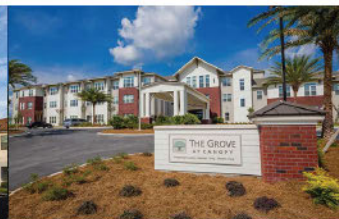
THE GROVE AT CANOPY