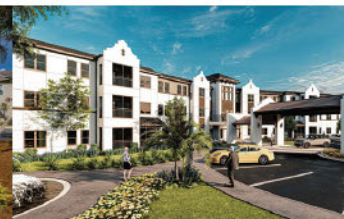
THE GROVE AT TRELAGO