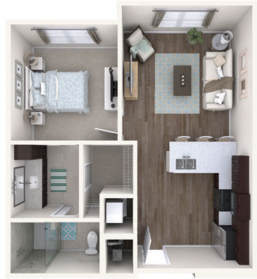
Bayshore (674 sq ft) – 1 Bedroom, 1 Bath