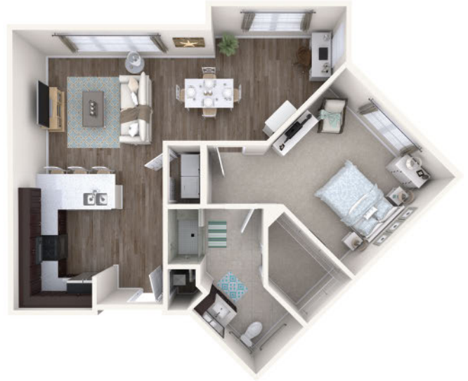
Coral Cove (941 sq ft) – 1 Bedroom + Den, 1 Bath