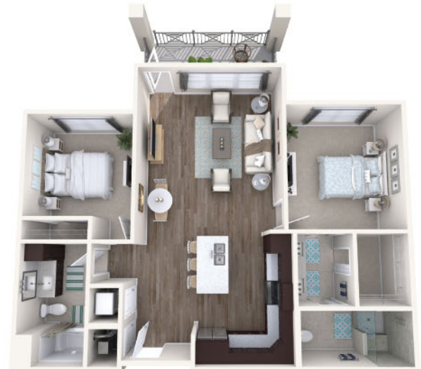
Everglade (1,102 sq ft) – 2 Bedroom, 2 Bath