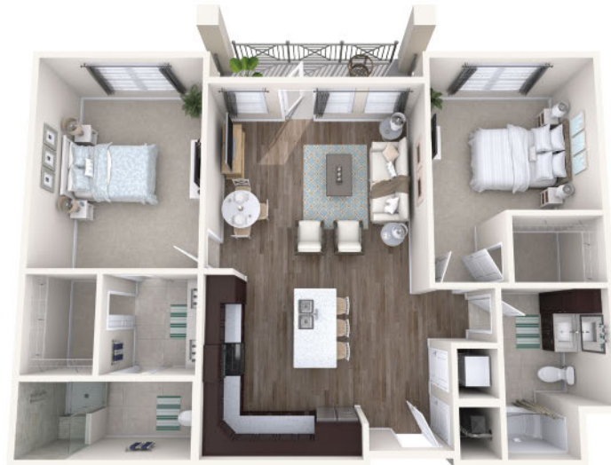
Grand Cay (1,224 sq ft) – 2 Bedroom, 2 Bath