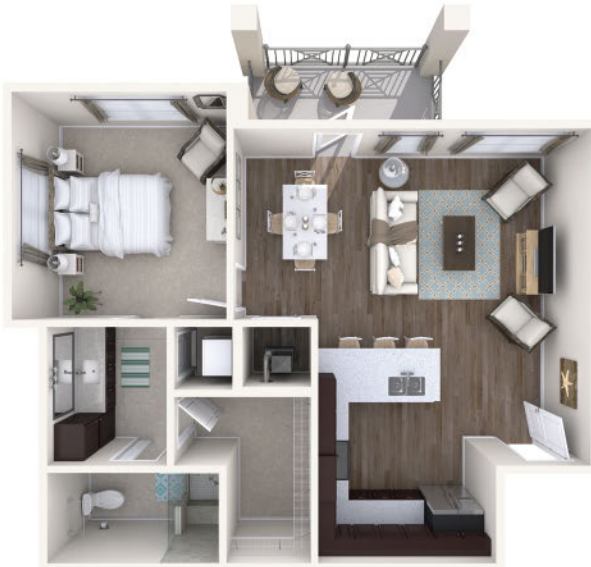
Atlantic (849 sq ft) – 1 Bedroom, 1 Bath