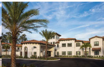
STARLING AT SAN JOSE