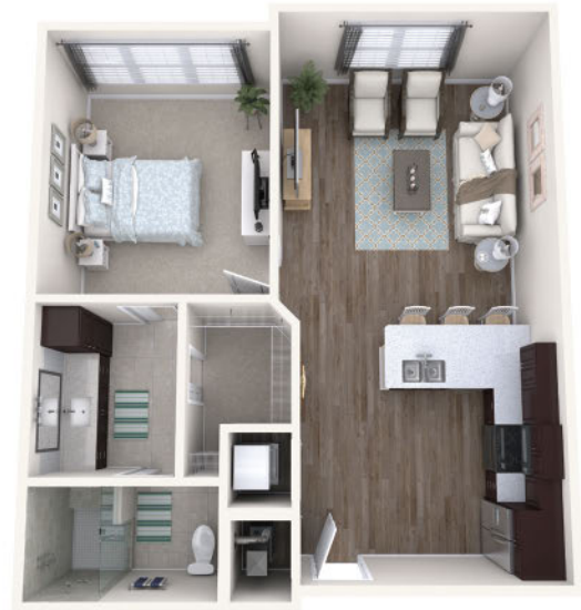
Bermuda (765 sq ft) – 1 Bedroom, 1 Bath