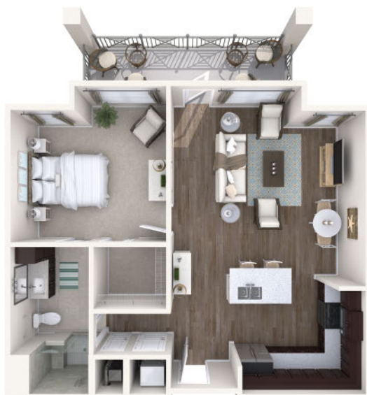
Hammock (816-864 sq ft) – 1 Bedroom, 1 Bath