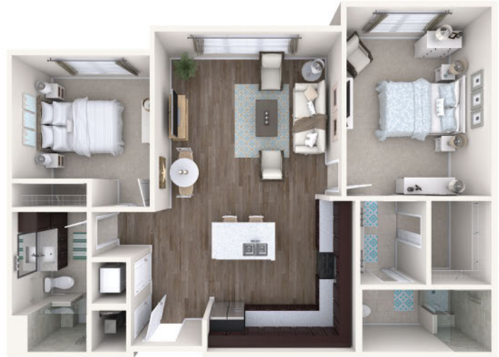
East Bay (1,146 sq ft) – 2 Bedroom, 2 Bath