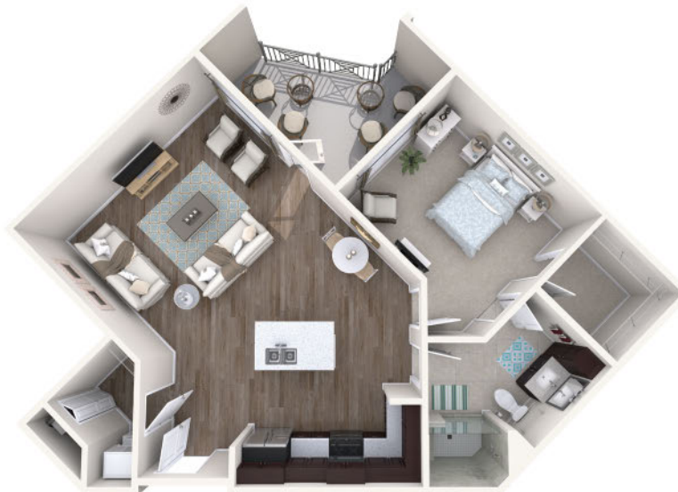
Sundance (900 sq ft) – 1 Bedroom, 1 Bath