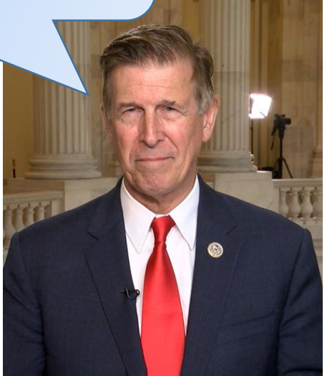
Rep. Don Beyer (D-VA) Senior Member House Natural Resources Committee