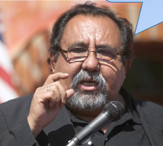
Rep. Raul Grijalva (D-AZ) Ranking Member House Natural Resources Committee

The best chance for statutory modernization of the Endangered Species Act is in the 115 th Congress