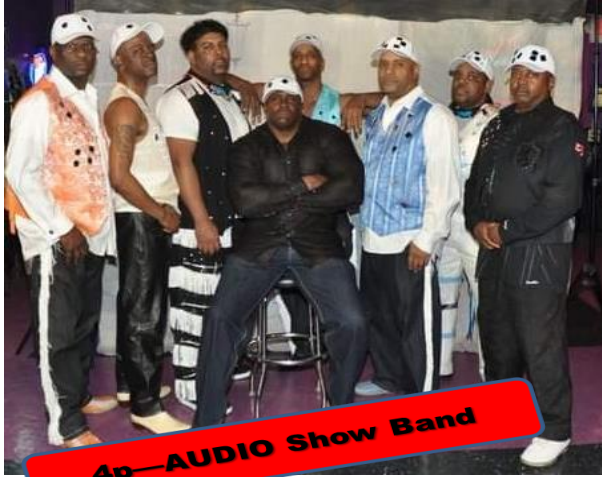
4p—AUDIO Show Band