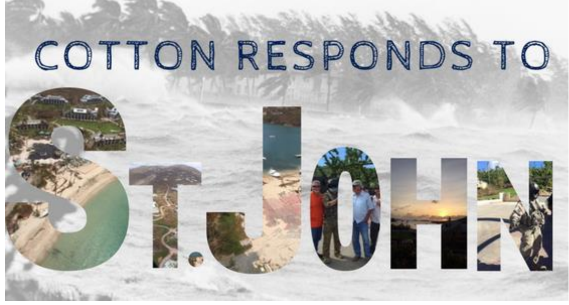
Cotton International Responds To The Caribbean Despite facing major obstacles while being in a remote location, Cotton responds to the island of St. John.

Head over to <u>Cotton TV</u> for a video recap of the event: <u>2017-18 Annual Success</u> <u>Meeting</u>