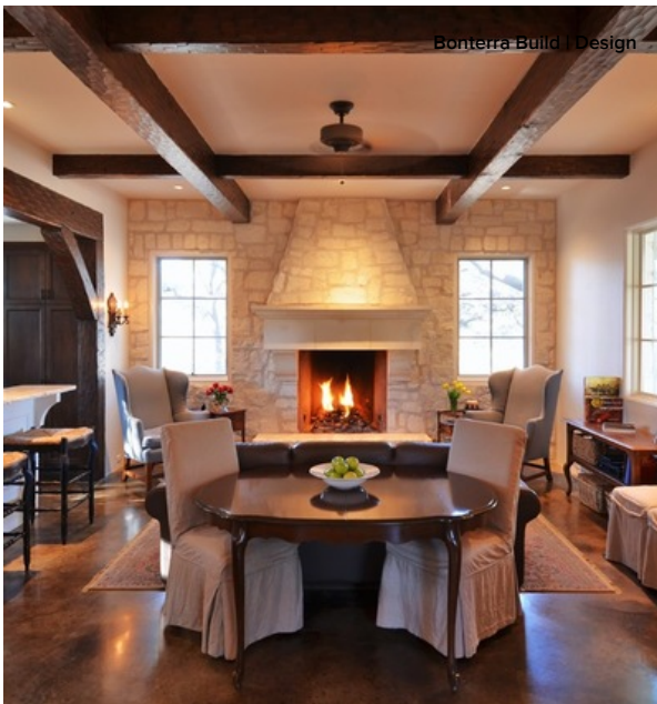
Bonterra Build | Design